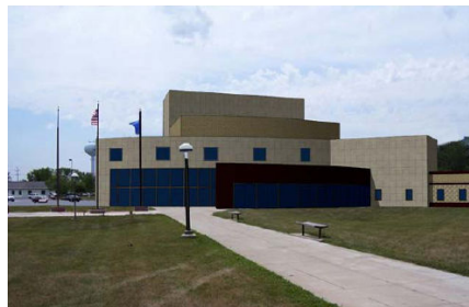
UW Fox Communication Arts Center: www.uwfox.uwc.edu/cac

All of this development follows on the heels of a new 130,000 square foot regional headquarters for Time Warner Cable, a $13.9 million Communications Arts Center at the University of Wisconsin – Fox Valley and a new $35 million Richard and Margot Warch Campus Center at Lawrence University.