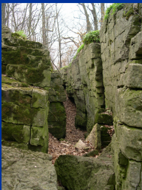
The Niagara Escarpment—High Cliff State Park