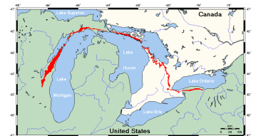
The Niagara Escarpment:

www.escarpmentnetwork.org for more details.